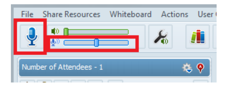
Suggestion #3 : Check your microphone settings

To do so please click the Microphone button on the top – above the attendees list. Your students have to do the same on their end.